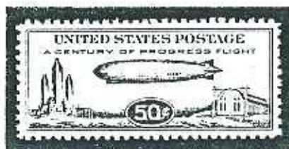
Mint, NH, Post Office Fresh

This copy of the "Baby Zep" will be awarded as a door prize to one lucky attending collector.