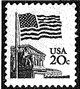
17 Billion of

Every year in the U.S. some 29 billion miniature images of America roll off the printing presses at the Bureau of Engraving and Printing--that's how many U.S. postage stamps it takes to meet public demand. The Bureau is a highly-successful branch of the Treasury Department which works around the clock for 50 weeks a year. Keeping pace with that demand requires modern high-speed presses with a high degree of reliability. The speed of the Bureau's presses is almost beyond comprehension. The $3.2 million D-press (a six-color offset, plus three-color intaglio press) has an operating speed of 365 minute. To state that in less technical press can produce a roll of stamps, 20 e and almost one and one-quarter football g, every minute!